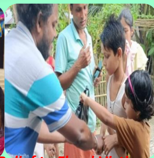
Relief to Flood Victims