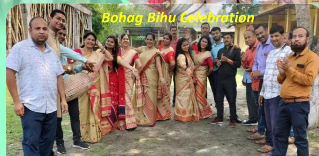
Bohag Bihu Celebration